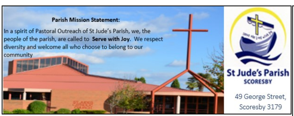
32nd SUNDAY ORDINARY TIME—YEAR A 12th November 2023